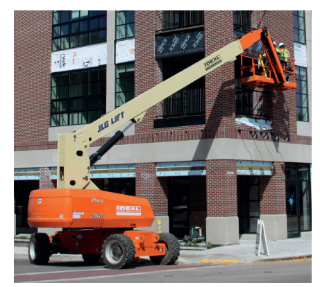
Rental markets could see softening in 2020.

In excess of $1 billion will be spent on growing Sunbelt's fleet, while up to C$60 million will be invested in expanding Sunbelt Canada's fleet. In the first quarter of 2019, $368 million was channeled into growing the Sunbelt U.S. fleet, and C$25 million was invested in fleet growth for Sunbelt Canada.